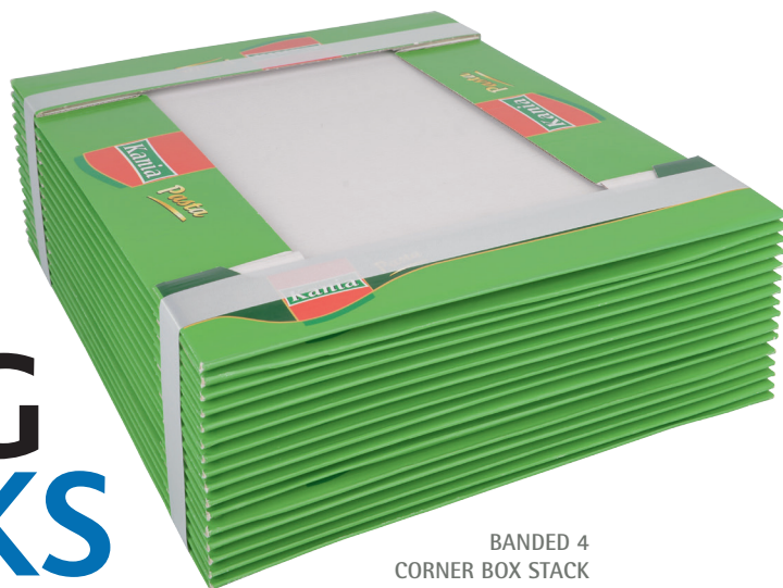
BANDED 4 CORNER BOX STACK

THE BAHMÜLLER POWERPACKER COMBINES COUNTING, SEPARATING, STACKING AND STRAPPING IN ONE PROCESS FOLLOWING THE SPECIALTY FOLDER-GLUER.