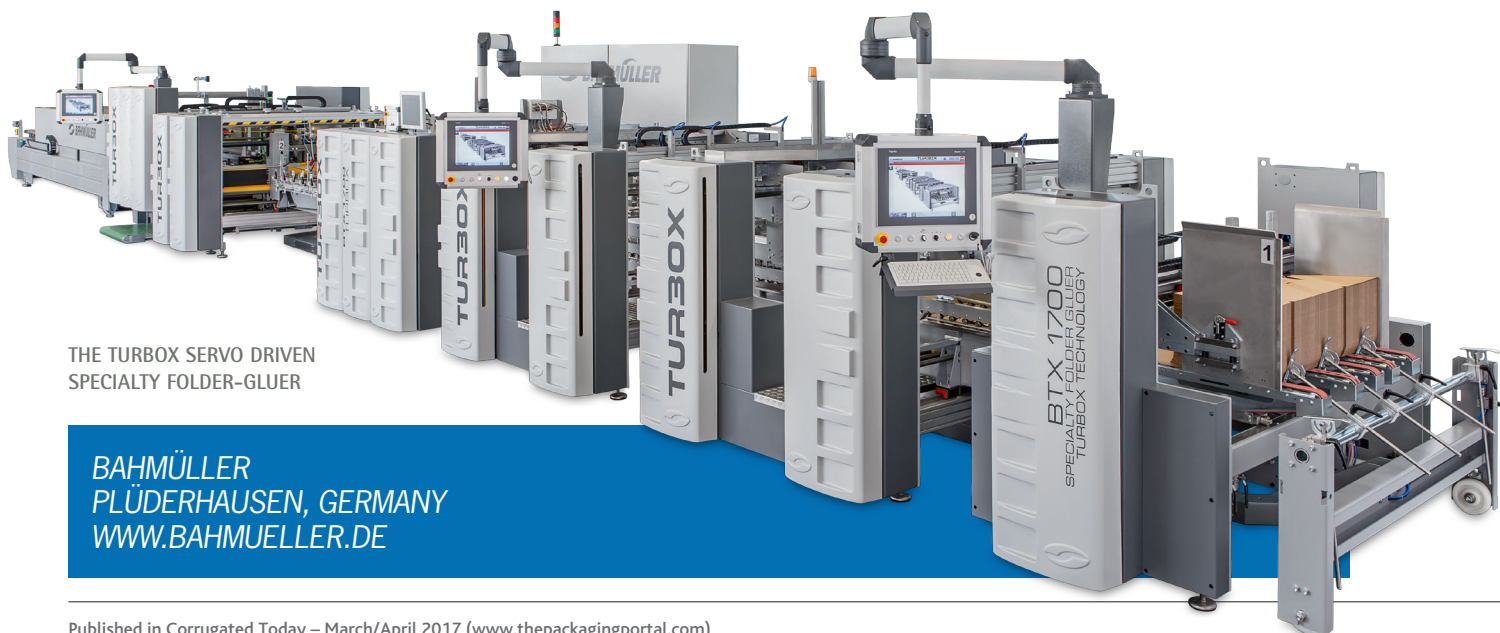
THE TURBOX SERVO DRIVEN SPECIALTY FOLDER-GLUER

The Powerpacker is a packing solution that combines counting, separating, stacking and strapping in one process following the specialty folder-gluer. It can handle different box types like straight line, 4 corner, 6 corner or special shelf ready packaging boxes and displays. Furthermore, the integrated inverting device guarantees even and equal stacking of crash-lock box bundles.